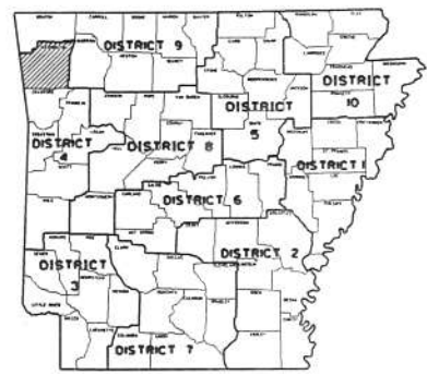
ARK. HWY. DIST. NO. 4