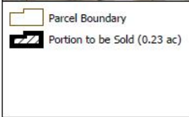
Exhibit A: Parcel 765-12173-000 Land Sale Request Fayetteville, AR